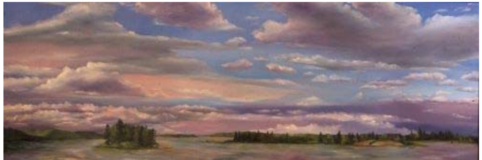
Diane Canfield Bywaters, oil

The cost of your work should be slightly higher than the usual price for your works, as it will include several costs of preparation and delivery. Use the worksheet below to calculate the price you ask for on your Image List Form.