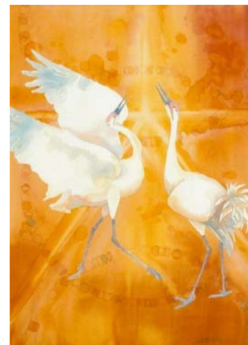
Janet Flynn, watercolor

There are five facilities within Wisconsin's Department of Natural Resources (DNR) that have funds available to purchase artwork. All five have a strong interest in artwork portraying natural, environmental subjects that could extend to landscape, animals, geology, historical or youth. The DNR Northeast Regional Headquarters is an office location for 130+ DNR employees, and serves as a customer service facility for the DNR. They have identified large wall spaces (12+ ft) and a possible display case of unlisted dimensions with indirect natural or artificial light in their lobby and in office spaces. They have mentioned an interest in artwork with a "Seven Generation" or sustainability theme, potentially work from Oneida or Menominee Nation artists. They have also expressed interest in textiles, photography, mobiles and assemblage. The Ice Age Interpretive Center expects to have over 12 feet of wall space in the entrance or lobby area. This educational facility is open to exploring different styles of art, but is most interested in works that are nature oriented and relate to the natural surroundings and geological uniqueness of the park. They have identified an interest in interactive works, along with mobiles